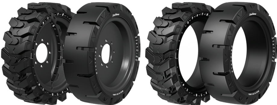
With or without rim