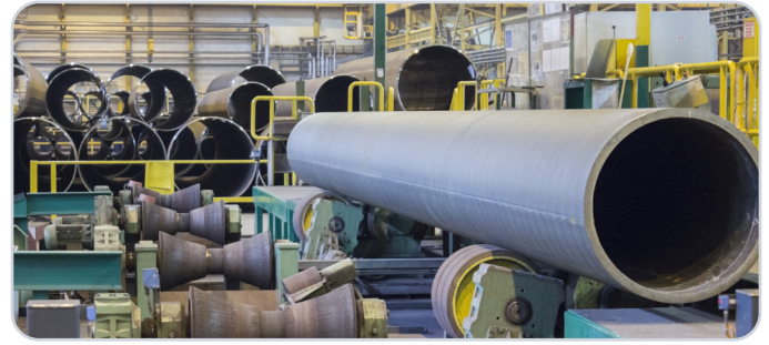
Available in sizes ranging from 2" to 16" OD and supporting loads up to 27,000 lbs.